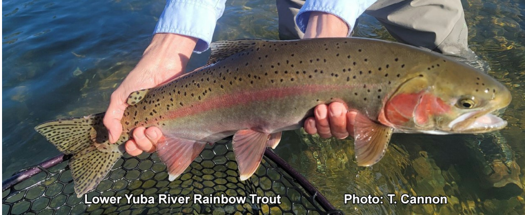
Lower Yuba River Rainbow Trout