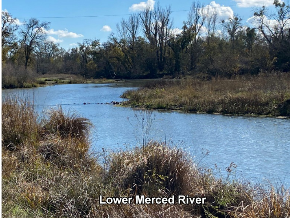
Lower Merced River