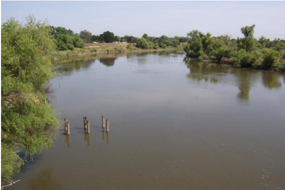
San Joaquin River at Vernalis