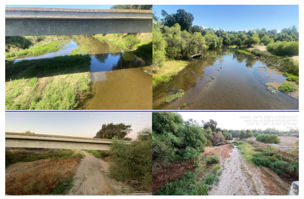
Figure 3. Photographs taken from Hatfield Bridge (RM 2.5) on May 5,2022 (top) September 14. 2022 (bottom). Left photo is looking downstream, right photo is looking upstream.