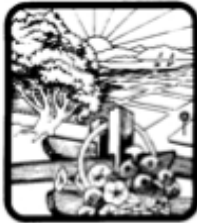
Santa Clarita Organization of Planning and the Environment (SCOPE)