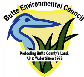
Protecting Butte County's Land, Air & Water Since 1975