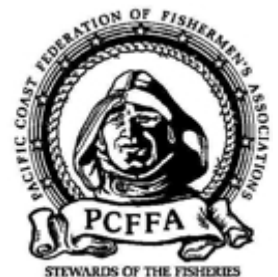
STEWARDS OF THE FISHERIES