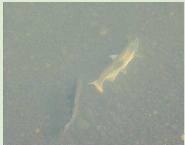
Spawning Chinook Salmon, Lower Tuolumne River December 3, 2018