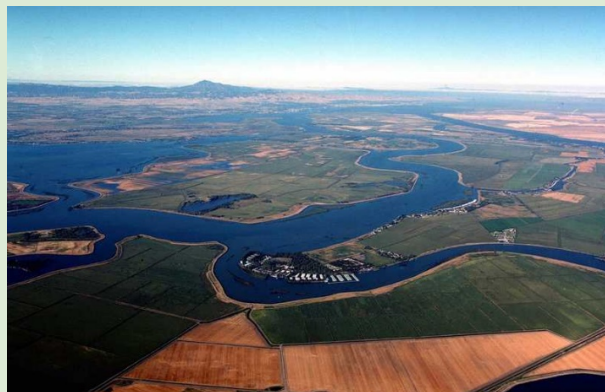
Sacramento-San Joaquin River Delta

It now appears that there is almost no chance that Delta tunnels will be approved and begin construction before Governor Brown leaves office in January 2019. The roadblock emerged on November 15, 2018 in a proceeding before a state agency that most people don't know about and even fewer understand: the Delta Stewardship Council.