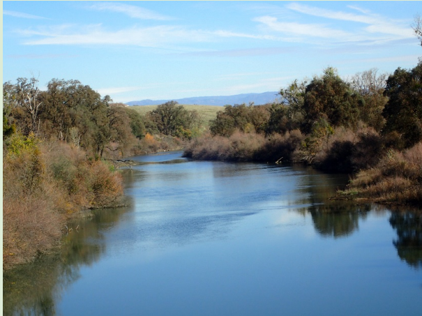
Lower Tuolumne River at Roberts Ferry Bridge December 3, 2018

The proceeding before the Stewardship Council is squarely in the critical path of DWR's efforts to construct the Delta tunnels. Nine groups of appellants showed up with well-researched and cogent arguments, and complemented one another well. They have made a difference. Not surprisingly, the nine groups represent most of the entities that have also been in the forefront of opposition in the three-year proceeding on the Delta tunnels before the State Water Resources Control Board.