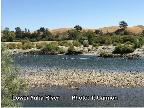
Lower Yuba River

The YRDP controls flows on the lower Yuba River. The Project has been undergoing relicensing before the Federal Energy Regulatory Commission (FERC) since 2011. As part of the licensing process, the California State Water Board issued a Water Quality Certification for the project on July 17, 2020. 1 The Certification became final for purposes of appeal (or "reconsideration") on December 15, 2020.