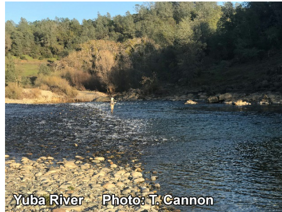
Yuba River

The HRC letter requested that EPA immediately suspend the 2020 Rule, since the Agency projected it would take 2 years to revise the regulation. Due to litigation by CSPA's HRC allies, a coalition of states, and others, a federal judge in California issued a ruling on October 21, 2021 that threw out ("vacated") the 2020 Rule. CSPA and allies now have a much clearer path to advocate for improvements to regulations concerning Section 401.