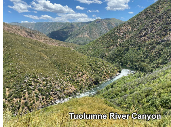
Tuolumne River Canyon

For further discussion of the issues of the cases, see CSPA Opposes Turlock and Modesto Irrigation Districts' Petition for Waiver of Clean Water Act ("CSPA Files Second Lawsuit against FERC over Waiver of Clean Water Act").